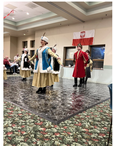
On the evening of January 21, Fr. McCormick Council 3880 celebrated our annual Polish Dinner. Polish Dinner fare and Dancers were extremely enjoyable!