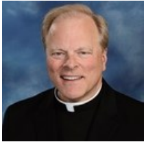
pleased with my recovery.