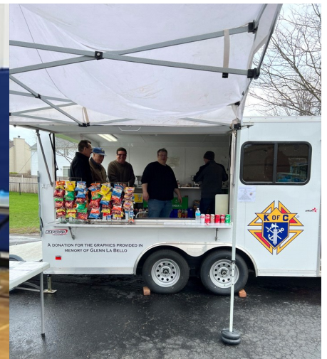
Always ready to serve up Hot Dogs, Brats and Chips, etc.!