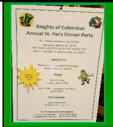
St. Paddy's coming up 3/12/2016.