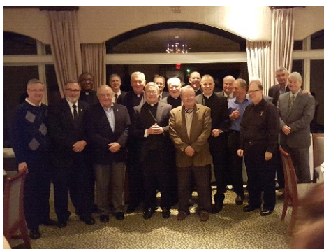
Clergy Night February 4, 2016 at the Crystal Lake Country Club.