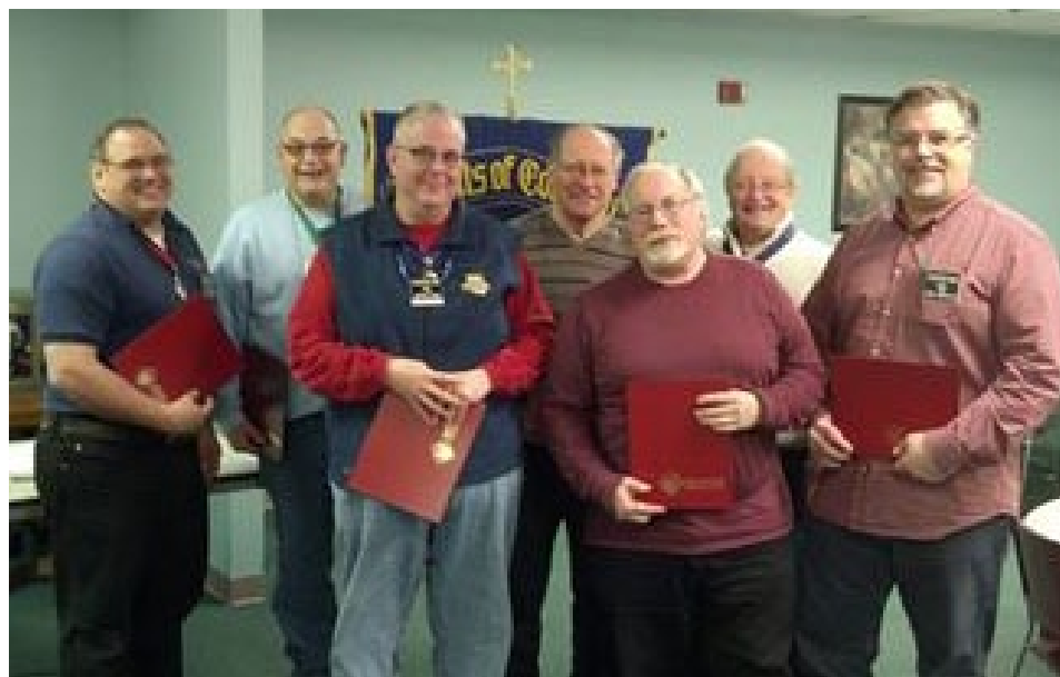
Our latest Knights of the Month