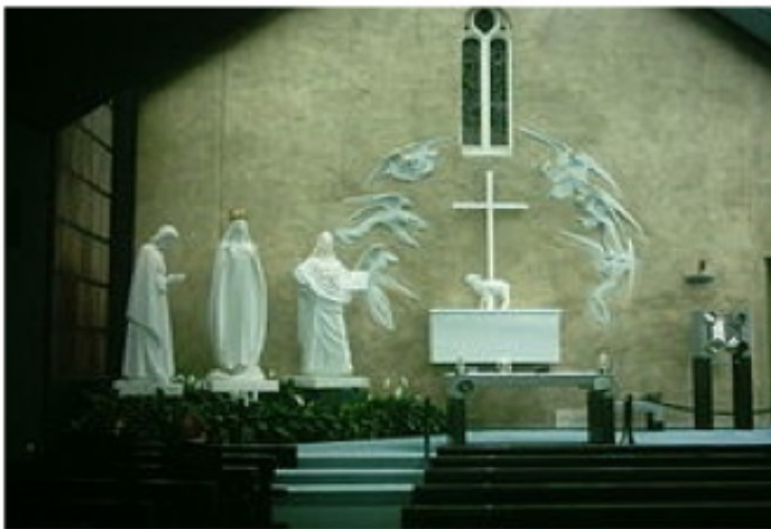
Above is a depiction of the Apparition seen on August 21, 1879, Right: Aerial view of St. John the Baptist Church and Shrine in Knock Ireland