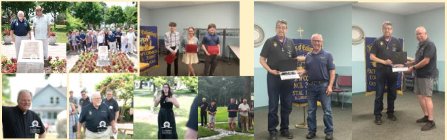
Pictures from McCormick Park Plaque. Essay Contest Participants, Bi-Lingual Rosary and from the Business Meeting (2 others not included. Apologies.)