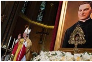
live for the month.