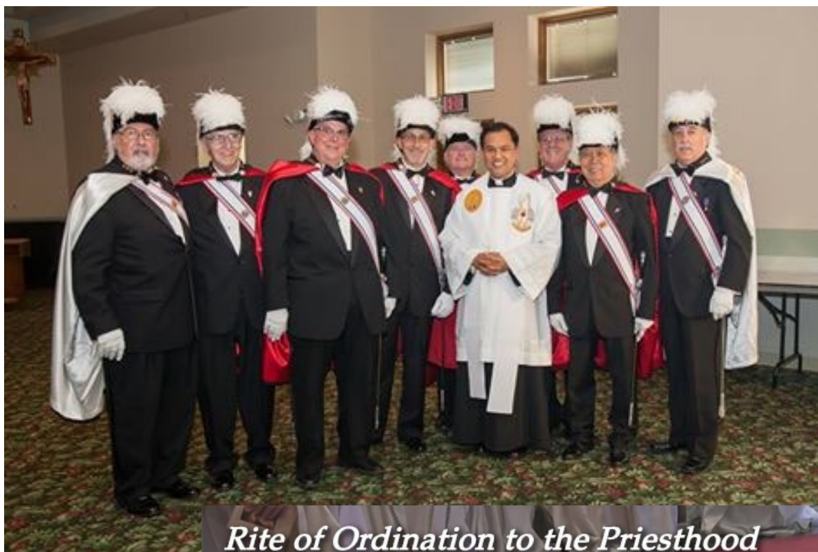
Rite of Ordination to the Priesthood