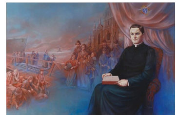
Lady's Auxiliary. Amen.

which is the Church. Let the inspiration of your servant prompt us to greater confidence in your love so that we may continue his work of caring for the needy and the outcast. We humbly ask that you glorify your venerable servant Father Michael J. McGivney on earth according to the design of your holy will. Through his intercession, bless our parish, our Knights of Columbus Council and